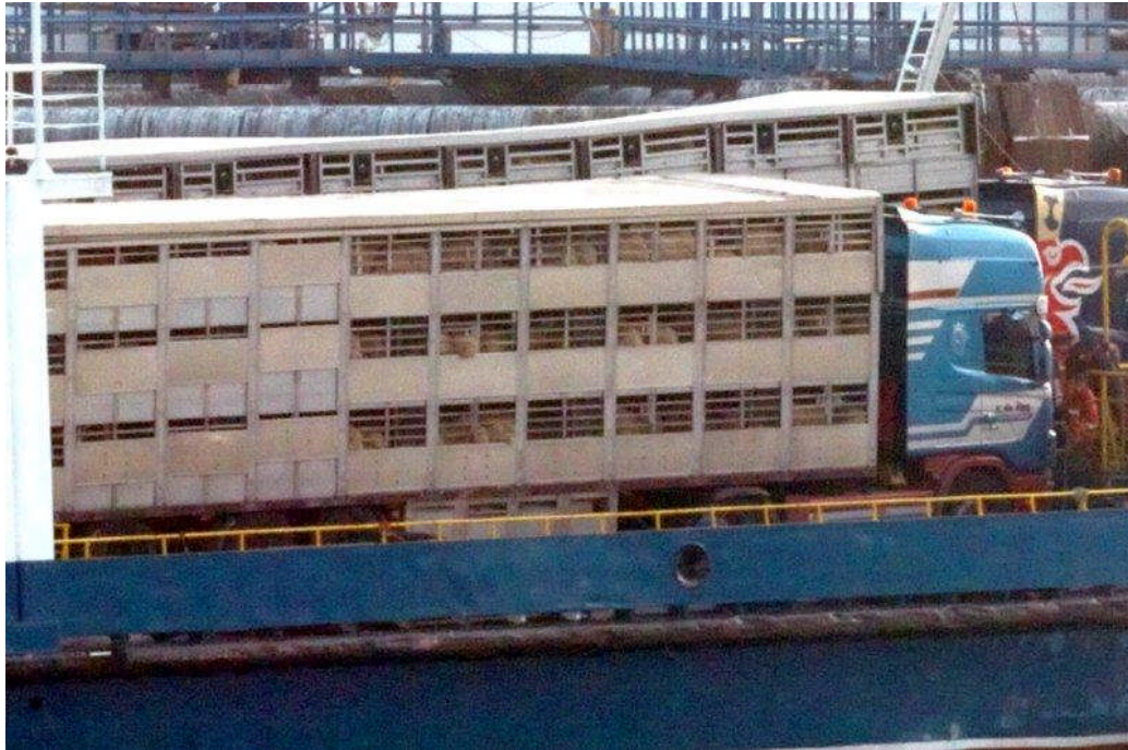
A vehicle which meets EU standards ? – or simply Conservative Animal Health Standards