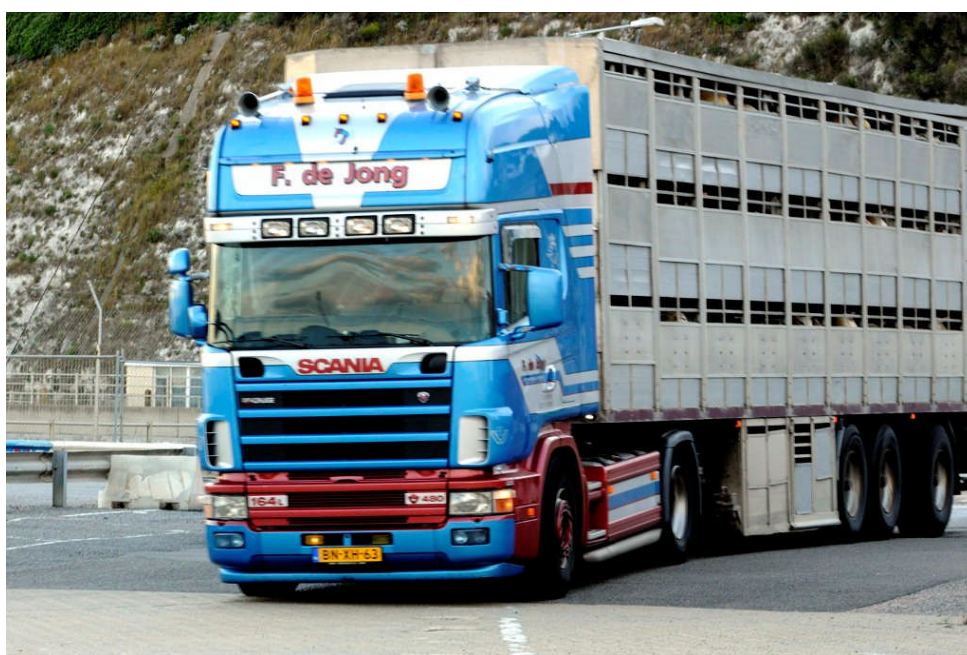
BN XH 63 of 'F de Jong'