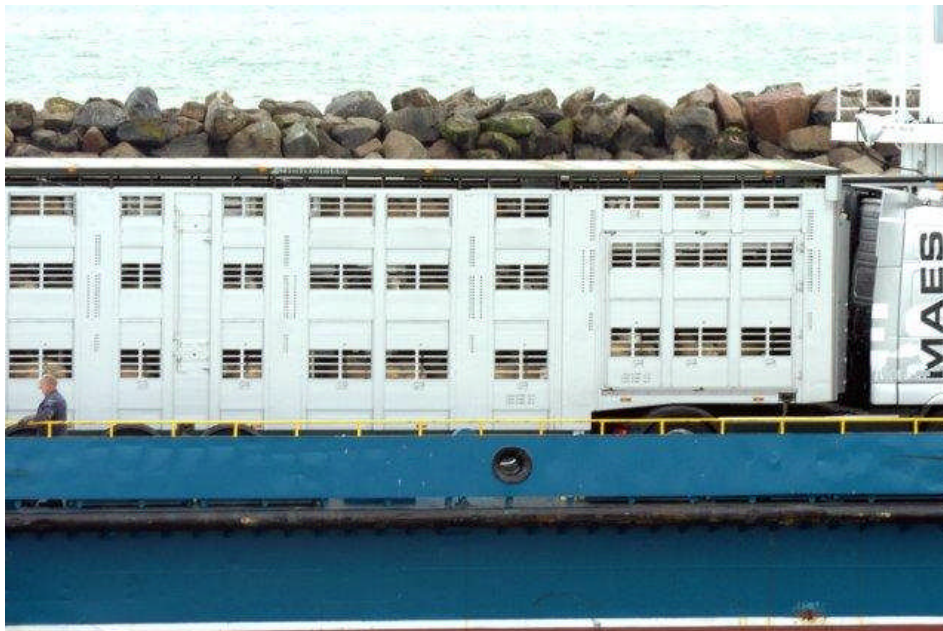
'MAES' - 3 Tier - Sheep.

1523hrs No.2. Registration number VMS 073B (front) / QGL 375 (rear). Nationality: BELGIAN. Name 'MAES'; grey and green articulated transporter carrying sheep in 3 tiers.