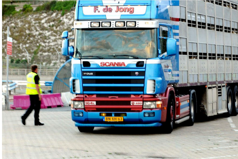
KALE Archive Photo - BN XH 63 - 'F. de Jong'

The cab (tractor) unit of this vehicle was the one that drove the unaccompanied white box trailer off the vessel 'Joline' before exiting the docks with its own trailer, as described in the previous KALE report 'J 21'.