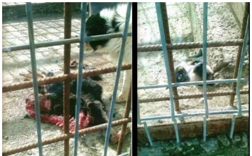
Photo: City hall dog shelter Slatina, February 2014, dead dogs

As an example the official answer of Sanitary Veterinary Directorate Olt to FNPA, with regards to the city hall shelter Slatina: "our controls done during the year 2013 did not reveal nonconformities relating to the accommodation, feeding, watering, hygiene" .