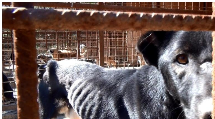
City halls' dog pounds

The personnel employed are untrained people, they do not have any empathy with animals, sometimes they are dog haters and sadistic.